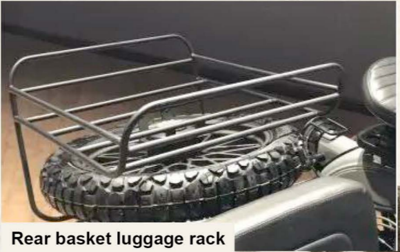
Rear basket luggage rack