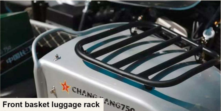
Front basket luggage rack