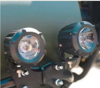
Long range light

DIMENSIONS L x W x H: 2235 X 1655 X 1070 mm seat height: 780 mm Ground clearance: 1475 mm Weight: 365 mm Tank: 20 L (4 l reserve)